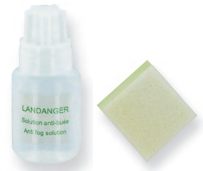
E202100 STERILE ANTI-FOG SOLUTION