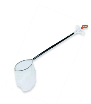
E213210 / E213217 10 MM AUTOMATIC RETRIEVAL BAG