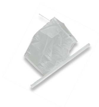
E213250 / E213255 RETRIEVAL BAG WITH MEMORY WIRE