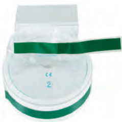
E202000 CAMERA SLEEVE