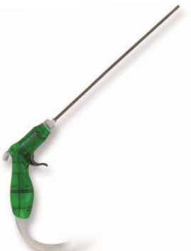
E212411 / E212412 REVOLVER SUCTION/IRRIGATION KIT