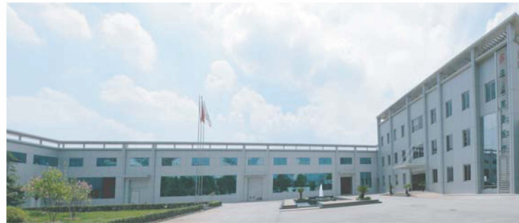
State-of-the-art manufacturing facilities.

At Frankenman, we believe we're not so much in the business of making instruments but in the business of making surgeries more successful.