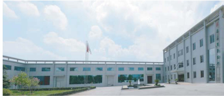
State-of-the-art manufacturing facilities.

WHEN YOU PUT PATIENTS' HEALTH FIRST, REMARKABLE THINGS FOLLOW